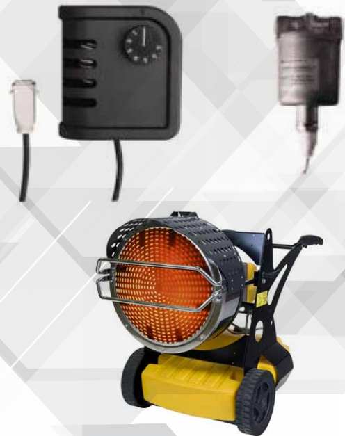
Pictured above: XL9SR 15.8 Gallon Roto-Molded Plastic Tank