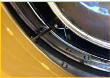
Welding performed by robots and 100% inspected