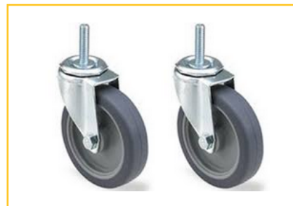
Swivel wheels Code 4033.978