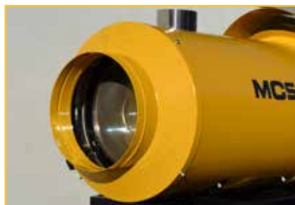
16" outlet Code 4033.976