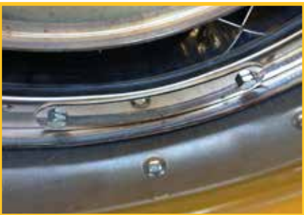
BV500 has windows which allow an easy access to the heat exchanger for cleaning