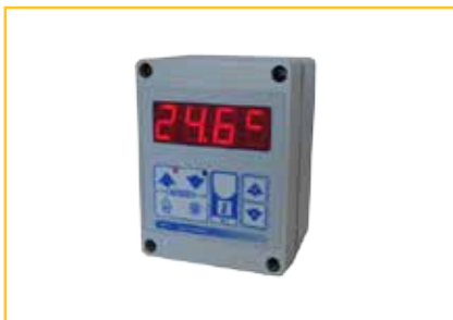
Digital room thermostat THD with cable 16 feet Code 4150.106