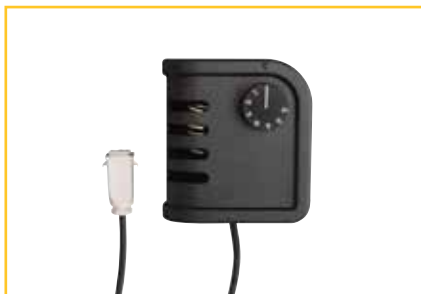
Room thermostat TH5 with cable 33 feet Code 4150.112