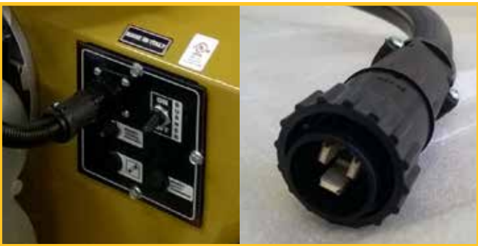
Quick connectors for electrical parts