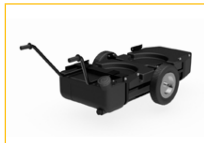
Trolley and tank Code 4033.977