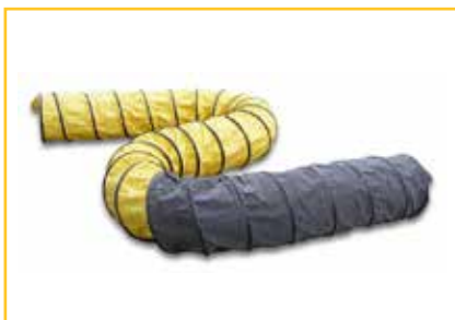
1x16" 25 feet flexible hose - code 4031.401 2x12" 25 feet flexible hoses - code 4515.553